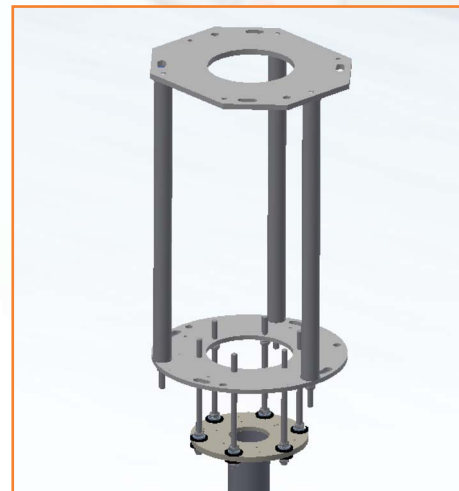
Substructure with Adaptor Plate and Extension to bridge large gaps