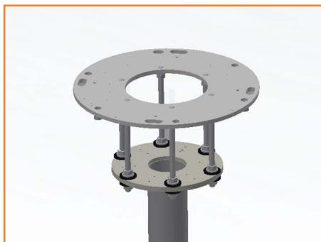
Substructure with Adaptor Plate to level out the system or to adjust small height differences

The ceiling substructures have been designed to allow an adaptable installation so that inconsistencies do not create a problem when installing the system. Uneven ceilings or small mismeasurements can be worked out with little effort.